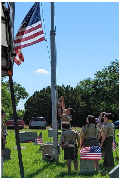
Scouts raising the flag at Old Greencastle Cemetery For Memorial Day