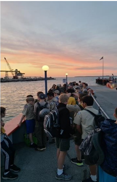
Riding the ferry to Kelly's Island after a long 3hr ride

Come young, come all! Gather round ye flag poles where thee will sing, dance, and do crazy things for food!