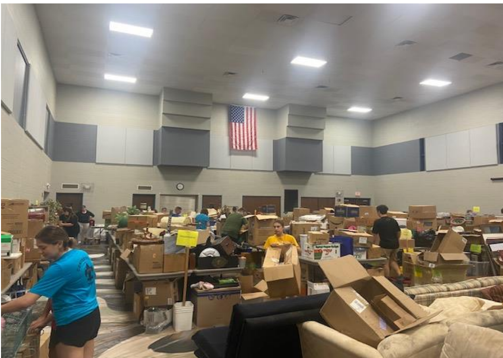
Scouts from Troops 515 & 516 helping to unload, unpack, and sort the items donated to the Troop Tent Sale