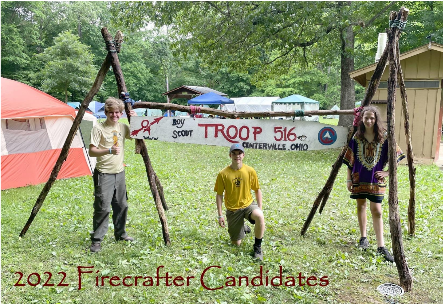
2022 Firecrafter Candidates