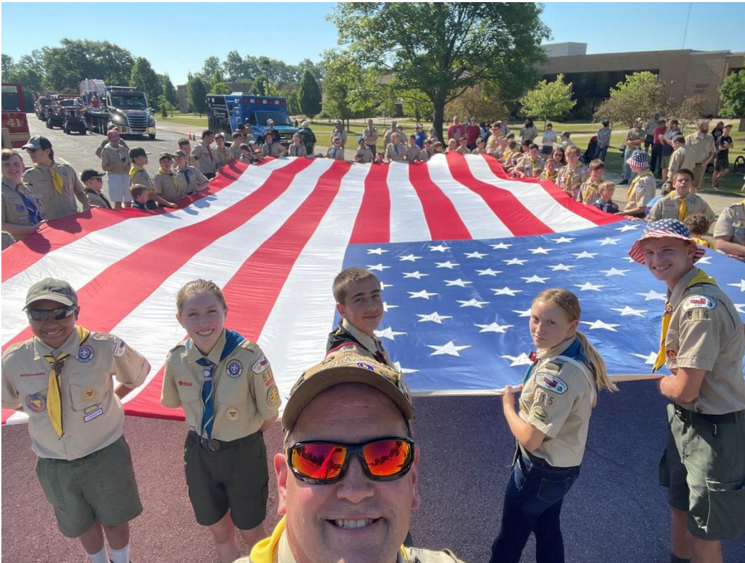
All the scouts helping to carry the Garrison Flag on the 4 th of July. Selfie! Everyone say CHEEEEEESE! (Well, only a couple)